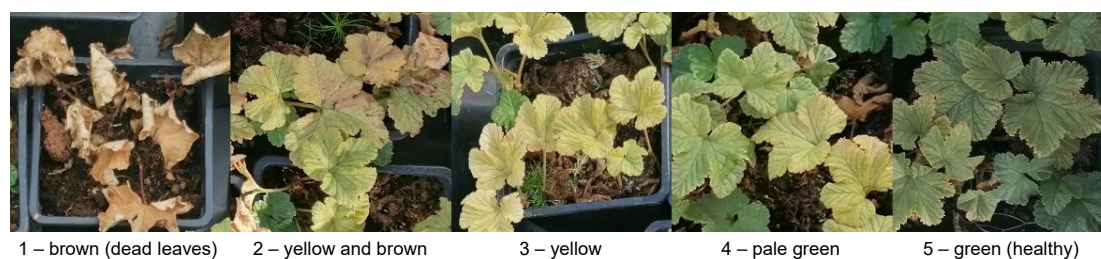
Figure 1. Representative example of visual scoring scale for evaluation of leaf condition in different substrate moisture conditions (scale adapted from Anwar et al., 2010).

Morphological parameters, including the number of leaves and winter buds per pot, leaf size (cm), and visual score were measured once, at the end of the vegetation season on September 1st. For each treatment, two diagonal measurements were taken for each randomly selected leaf to calculate the average size ( n = 30 ). The number of leaves and winter buds were counted per pot ( n = 15 ), pots from each treatment were selected randomly. Visual score scale (Fig. 1) was adapted from Anwar et al., 2010 for cloudberry leaves (5 – green and healthy, 4 – pale green, 3 – yellow, 2 – yellow and brown, 1 – brown (dead leaves)). Randomly selected pots ( n = 15 ) were rated by the average condition of the leaves in the pot using the scale.