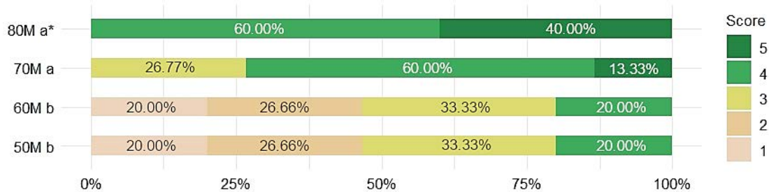
Figure 4. Visual scoring of cloudberry seedling leaf condition in different substrate moisture conditions in September 2023 (shown in per cent). 50M, 60M, 70M, and 80M – represent relative substrate moisture content at 50%, 60%, 70%, and 80% of full water-holding capacity. 5 – green and healthy, 4 – pale green, 3 – yellow, 2 – yellow and brown, 1 – brown (dead leaves).

Visual scoring revealed significant differences between the highest and the lowest moisture treatments (Fig. 4). 80M had the highest scores - all of the samples were given the highest scores of 5 (green and healthy) or 4 (pale green). Thus, 80M had visually the most green cloudberry leaves. For 70M, 73.33% of the samples were given the highest scores of 4 and 5, which was also indicative of good cloudberry vitality. 60M and 50M had no scores of 5 and overall had similar rating score percentages. Brown leaves indicate that plant tissue has dried out and photosynthesis has stopped. Considering that at the end of the vegetation season most of the 60M and 50M cloudberry leaves were visually yellow to brown (80.00% for both treatments), we conclude that relative peat moisture levels below 70% are insufficient in maintaining vital cloudberry seedlings.