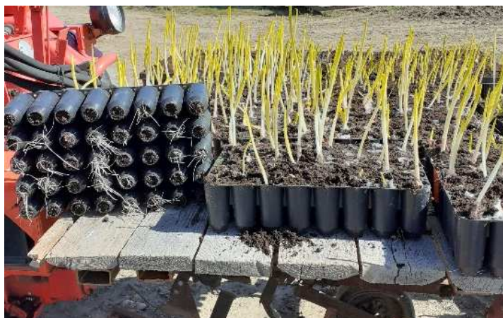
Figure 2. Trays with garlic plantlets.

In 2019, container plantlets from trays were planted on the field in the 2 nd decade of May at phenological growth stages BBCH 101-104, according to Lopez-Bellido et al. (2016) (Fig. 2).