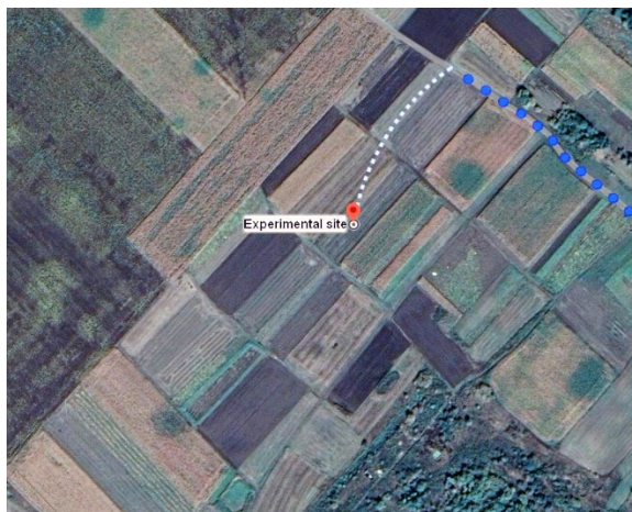
Figure 1. Location of the experimental site (coordinates 49°56'46.1"N 32°07'02.1"E).

The research is conducted in a field stationary experiment to study the productivity of a 5-field grain-legume crop rotation, which includes: spring barley - peas - winter wheat - soybeans - spring wheat ( Hordeum vulgare - Pisum sativum - Triticum aestivum - Glycine max - Triticum aestivum ). The structure of the crop rotation is as follows: cereals - 60%, including: winter wheat - 20%; spring cereals - 40%; legumes (peas) - 20%; technical crops (soybeans) - 20%.